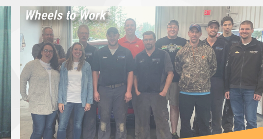
Wheels to Work