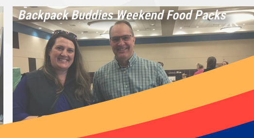
Backpack Buddies Weekend Food Packs

Our Mission: To transform lives in our community by uniting people and organizations to maximize donor impact.