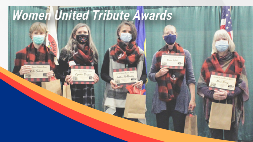
Women United Tribute Awards